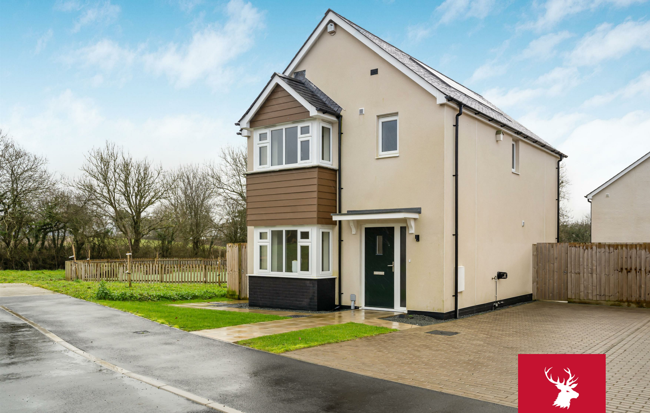
Plot 9, The Shearings